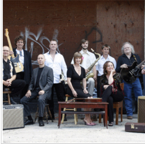
Moving From Me to We