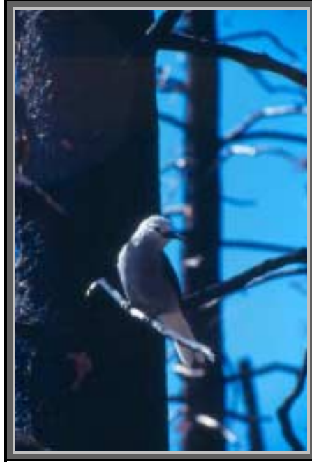
Figure 3. Juvenile Clark's nutcracker in a recent prescribed burn.

Similarly, whitebark pine has adaptations that accommodate seed dispersal by Clark's nutcrackers. The nutrient rich seeds of whitebark pine are wingless and remain in the cone after maturity. Cones are found on the tips of upswept branches, rather than close in to the core of the tree. This presentation allows the cones to be more easily seen by the passing birds (Lanner 1996). While the whitebark pine cones are still attached to the tree's branches, Clark's nutcrackers adeptly harvest the seeds by ripping open the cones with their long pointed beaks (Tomback 1978).