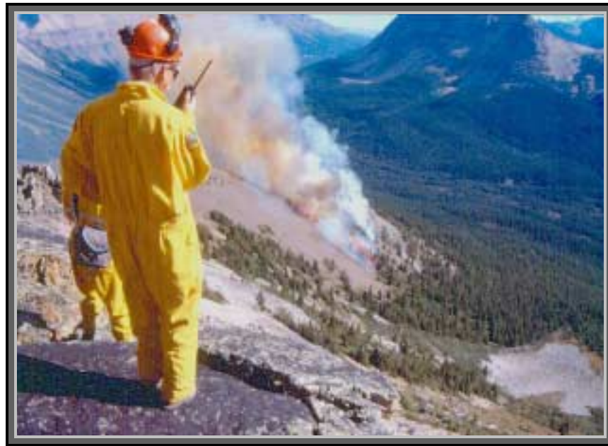
Figure 6: Field staff carrying out a prescribed burn (Helen Ridge) in the upper Bow Valley, Banff National Park.

This site was burned in 1998 and under the original design, is scheduled for a re-measurement in 2003. Because there are limited funds available for whitebark pine research, a balance must be achieved between the need to monitor previous burns such as the Helen Ridge site and the need for additional sites. Money has already been spent on the layout of three additional sites in the mountain parks, but these have yet to be burned. Continued agency support is needed so that these sites can be burned before the time and effort put into the layout and initial assessment is lost.