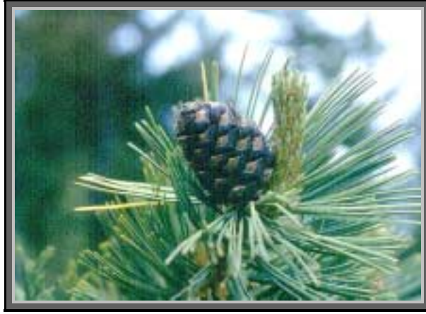
Figure 4. A female whitebark pine cone.

Whitebark pine produces masts of seeds every 3 to 5 years (Morgan and Bunting 1992) with intervening years having very low, or no seed production. In the years with low seed production, nutcrackers have been known to erupt from their usual habitat and travel great distances in search of other food sources (Fisher and Myres 1979). One such event was documented in 1976 when nutcrackers appeared in the Cypress Hills of Southern Alberta, over 300 km from their usual habitat (Fisher 1979, Fisher and Myres 1979). Although Clark's nutcrackers depend heavily on whitebark pine seeds as a food source, the relationship between whitebark pine and this bird species is mutualistic (Tomback 1982). Without seed caching by nutcrackers, practically no whitebark pine regeneration would occur. The few seeds that remain in the cones eventually drop to the ground and, if rodents do not forage them on, they rot before they germinate (Hutchins and Lanner 1982). Lanner (1996) points to the heavy wingless seeds as evidence of the co-evolution of the bird-pine relationship because wind is no longer an effective method of seed dispersal.