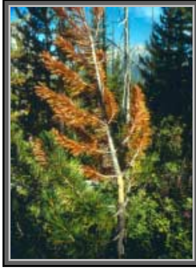
Figure 5: Girdling of a sapling at a blister rust canker.