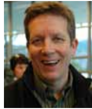
The Gallery pg 4