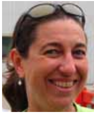
HR Matters pg 3