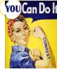
Bits & Bytes pg 9