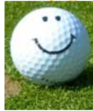
What's Happening pg 5