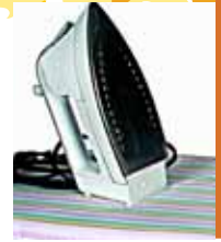
Classifieds pg 10