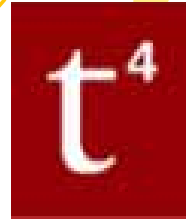
TechTips pg 9