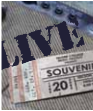
Weekly News pg2