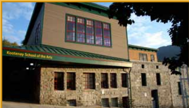
Kootenay School of the Arts at Selkirk College in Nelson, BC.