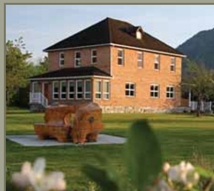
The Mir Centre for Peace in the West Kootenay.

Need more information? Contact our School of Renewable Resources at 1.888.953.1133, ext. 392.